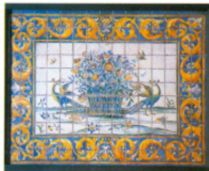
» Simes Studio created faux tile work for a balcony (left) to resemble antique English tile, and faux Portuguese tile (above) on a retractable screen to hide a television.